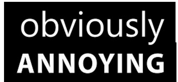
Illustration: Annoying sounds. I found this on the internet, the most annoying sounds in the world. See what you think. A knife on a bottle, fork on a glass, Chalk on a blackboard

A ruler on a bottle, Nails on a blackboard, A female scream, An angle grinder (a power tool), Squealing brakes on a bicycle, A baby crying, An electric drill.