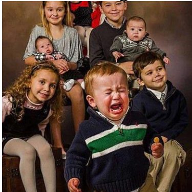
Illustration: Why your children need to be in family pictures. I'm sure you all remember loading the kids up in a car and taking them for family pictures. What a joy!

(Well, probably not at the time.) What can happen when on such a wonderful expedition with younger children includes maybe that one child has already gotten dirty the shirt he was to wear, another child has spilled food on a good pair of pants, and somehow you lost a shoe. Family pictures are important though, and at the time, the kids may not see how important it is, but they will. As children grow, they need to see