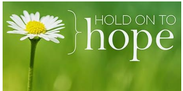
Illustration: Good luck charms people hold onto. Isn’t it amazing the things people cling to and hope they bring good luck? (some sense of hope). I checked on the internet, and one can buy a good luck charm (buy something to give you hope), something to hold onto in order to give hope, and one can pay most any amount. It’s amazing the concepts of hope people hang onto, and if you doubt that, just watch when people buy their lottery tickets. Some people have some crazy ideas. Here’s a few:

#2: How to become more committed as a worshiper and change your life forever: Hold Onto the Hope (23) Let us hold unswervingly to the hope we profess, for he who promised is faithful.